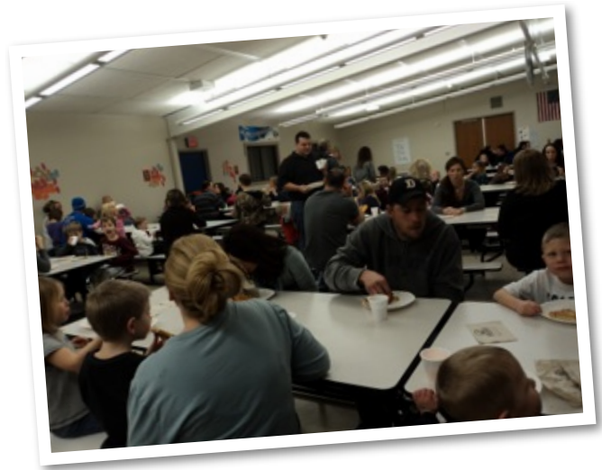
Above: Pizza for a hungry crowd.